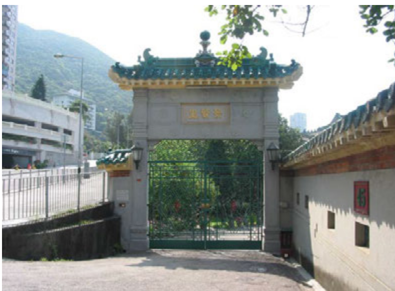
Entrance of the Building