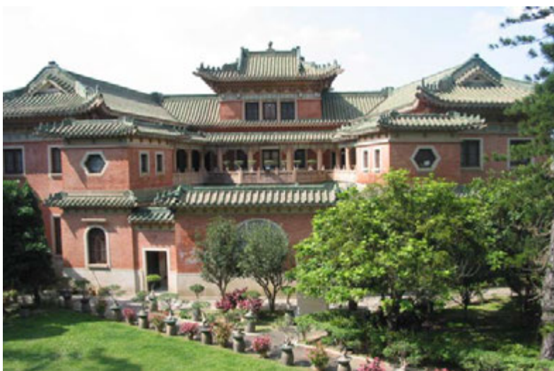
The Building at 45 Stubbs Road